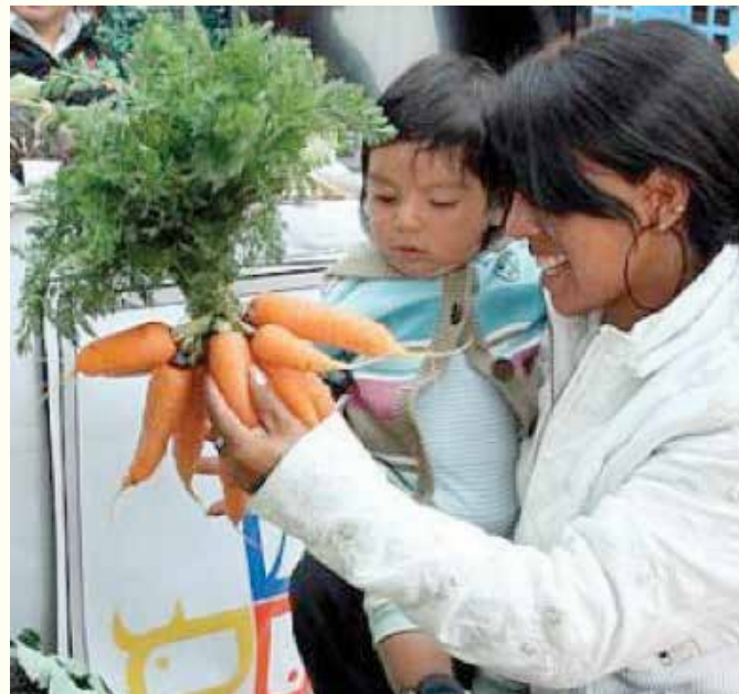
Kua' tepa' titakua kua' tipiluwahtu' ku mugune muskahtia sa tepa'.

Se kunechini tepa' muskahtia iyihitigu iye kua' gihtiwihtihtu' wa tepa' puni, kua' inuchipa gita'watia ge ne muskastihia wa teihki gikua iye.